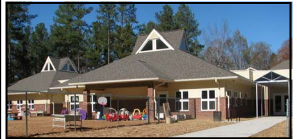
The New Early Childhood Pavilion

A very special thanks to our parent and teacher volunteers for all of their help on Sunday and Monday. Our move into the new Early Childhood Pavilion was very successful as a result of everyone's hard work. Thank you!!!