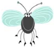
Fly on the Wall