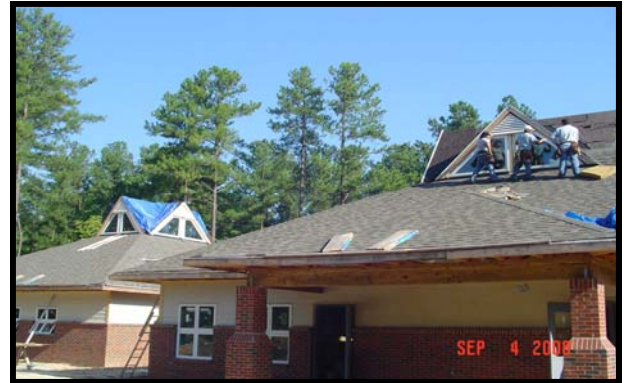
Workers putting the finishing touches on the roof.

This project is a huge volunteer-led undertaking and we can always use help! If you're interested in joining one of the many committees, or to learn more about the project, contact Bryna Rapp at bryna@furniturelab.com .