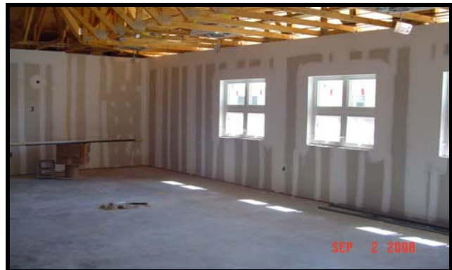
One of the Early Childhood Classrooms with the sheetrock up.