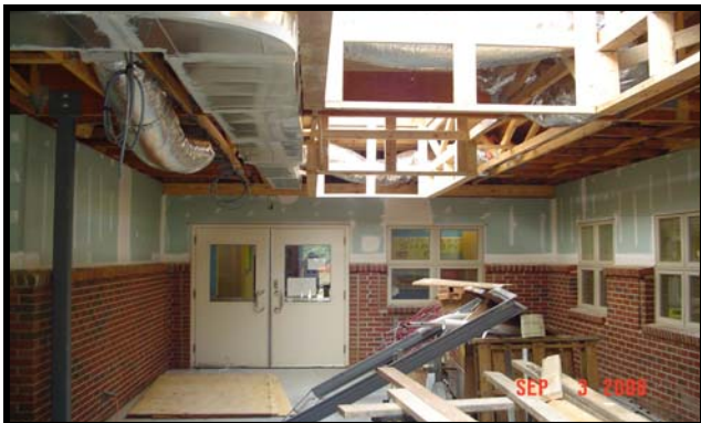
The Parent Lounge.

This project is a huge volunteer-led undertaking and we can always use help! If you're interested in joining one of the many committees, or to learn more about the project, contact Bryna Rapp at bryna@furniturelab.com .