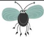
Fly on the Wall